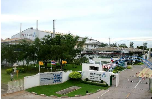
Map Ta Phut Plant (Thailand), H.C. Starck Tantalum and Niobium GmbH Group