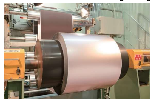
Processing of treated rolled copper surface (Hitachi Works)

Furthermore, in June 2018, we purchased a part of the shares of Material Concept, Inc., a venture initially founded in association with Tohoku University, a national university corporation, to participate in its copper paste business. Said company has superior technology for manufacturing copper paste, which is applied for wires and electrodes for electronic equipment, and received the Minister of Education, Culture, Sports, Science and Technology Award at the "Award for Academic Startups 2018" hosted by National Research and Development Agency Japan Science and Technology Agency. In addition, we concluded an organizational coordination and cooperation agreement with Tohoku University, in order to collaboratively carry out research development and foster human resource in the electronic materials field including next-generation wiring materials.