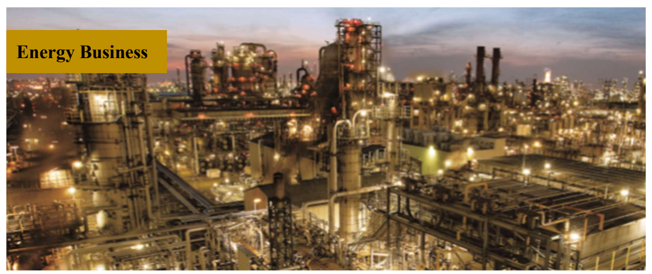
Results of the Energy Business