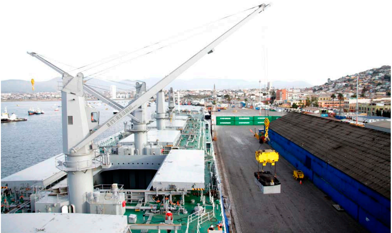
Photo: Loading the initial shipment of Caserones copper concentrate onto the Koryu carrier ship