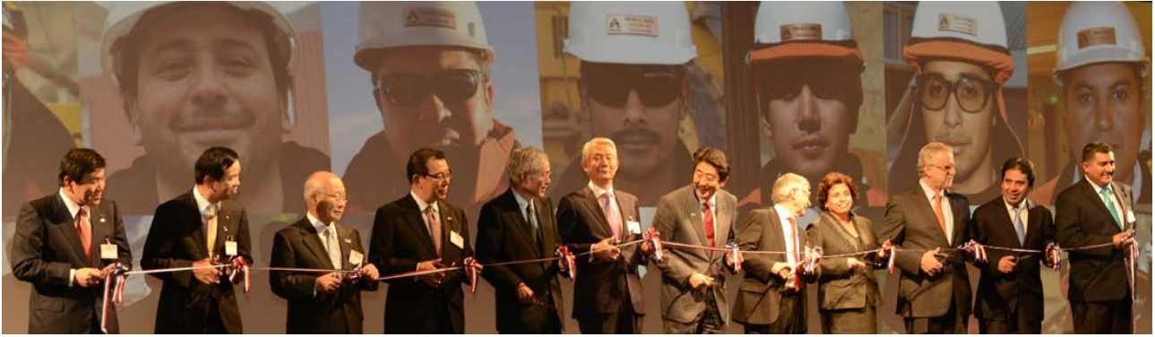
Photo: Ribbon-cutting at the opening ceremony