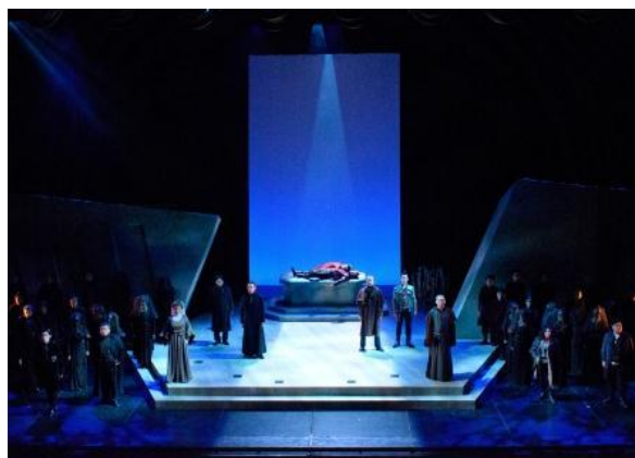
(“Romeo and Juliet”,)